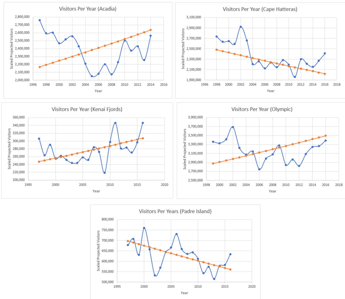
Figure 2: Visitor Projections for Each National Park